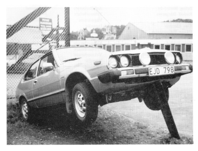
Fig. 1 The car with its front suspended by the pile hitting it from below

The 16th pile was rejected. However, what happened to the previously driven piles, the replacement pile, and the piles remaining to be driven? Was the entire piling reassessed considering that what is in the ground probably more resembles giant fish hooks than piles? No, Pile 16 was replaced and the job completed without any other change or extra precaution. Also, no other car was "piled upon".